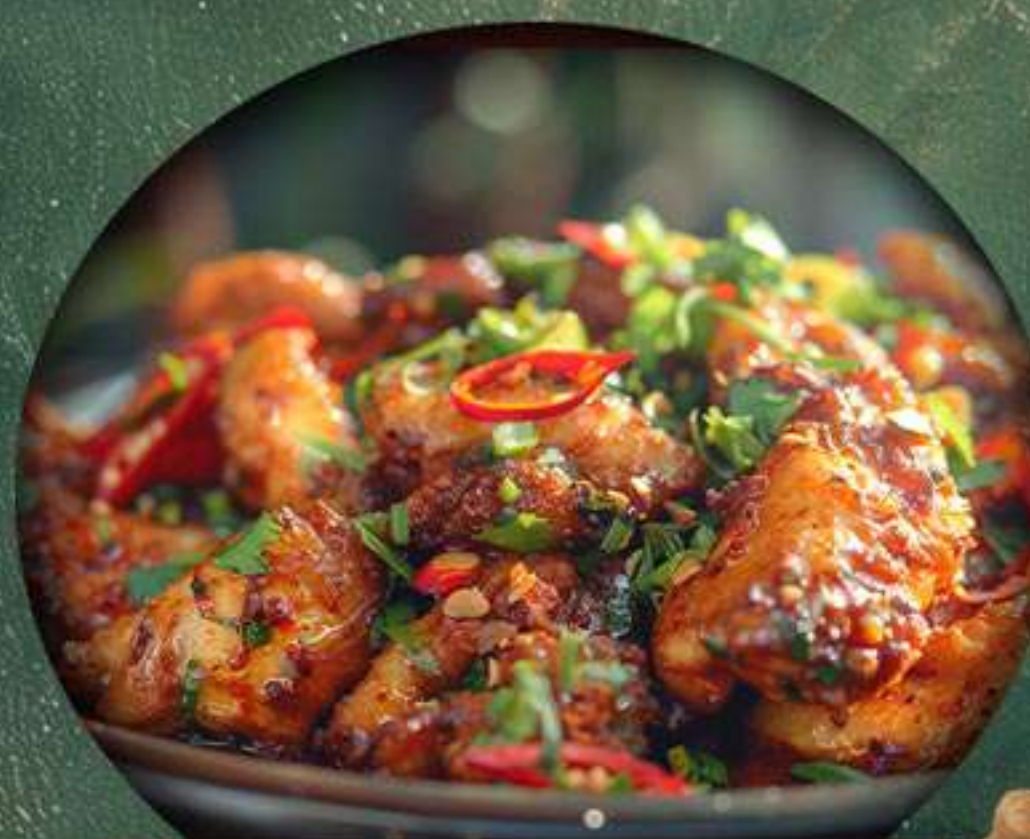
Rica Rica Chicken

Babi panggang karo, made from roasted or grilled pork and typically enjoyed with sambal, is an ideal choice for a family meal.