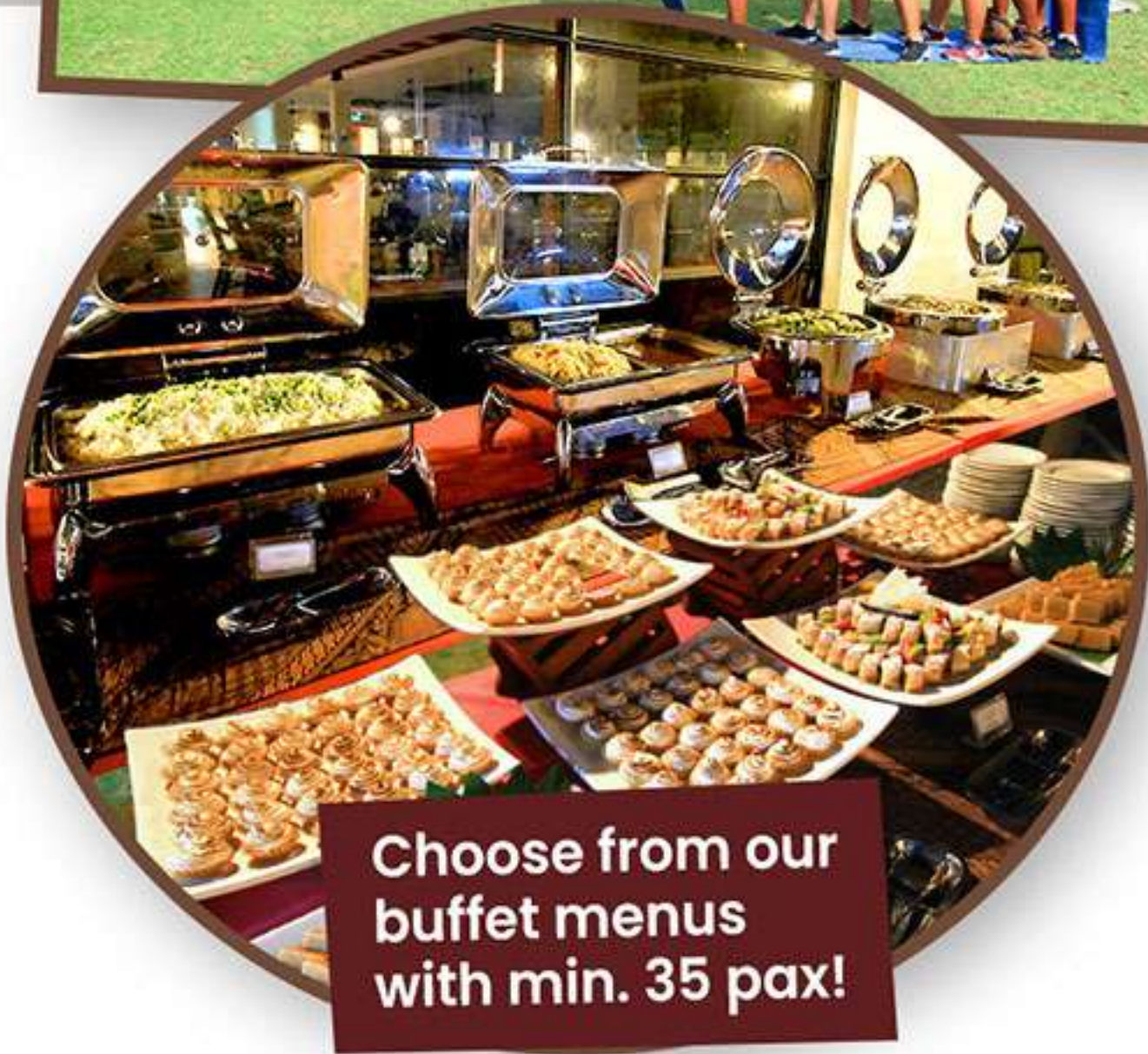
Choose from our buffet menus with min. 35 pax!